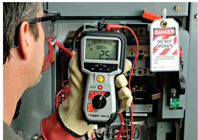
Panelboard testing is faster, easier and safer with the new MIT400 Series.